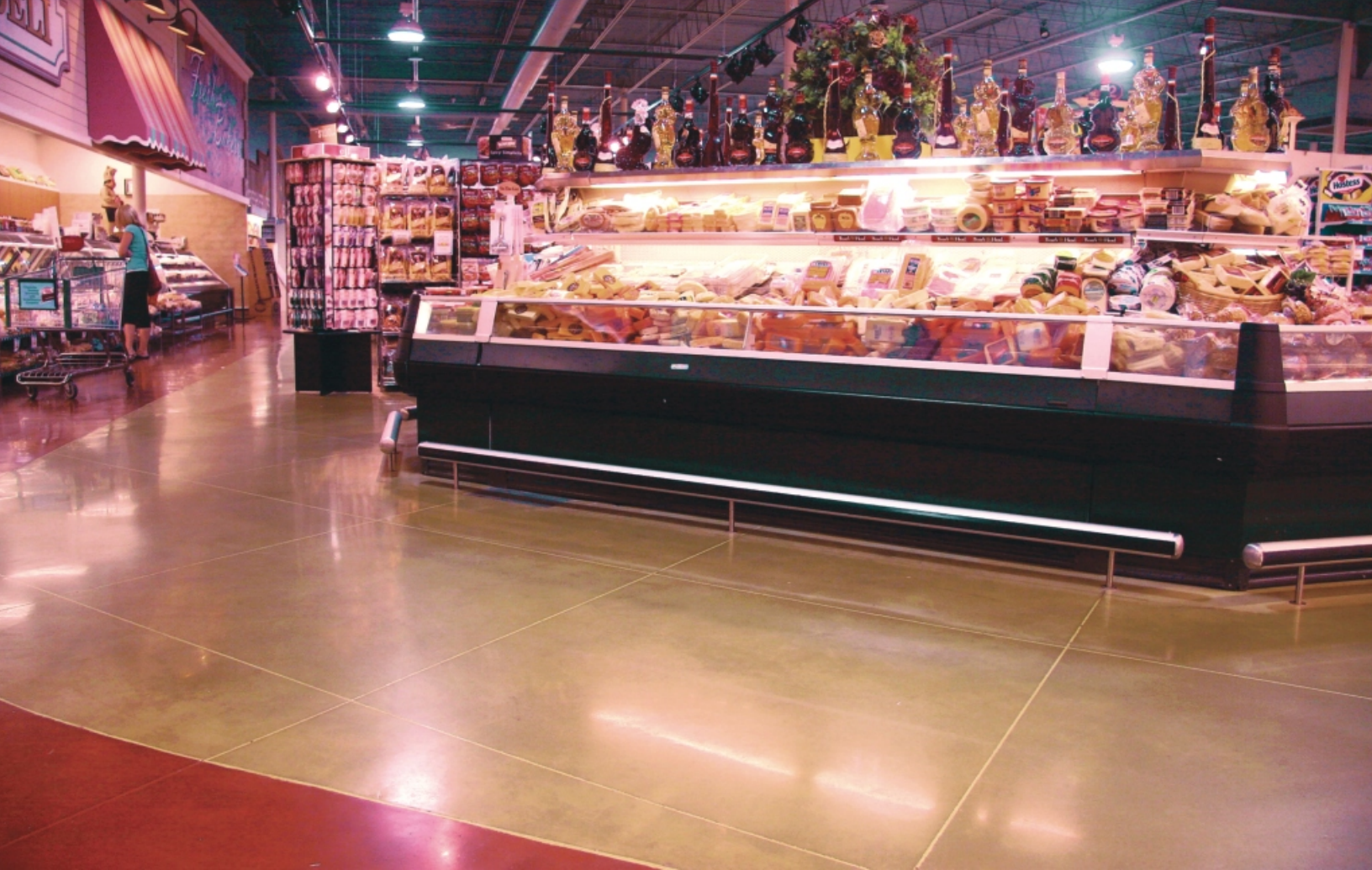
Retailers often use different colors to identify unique product sections and create a visual impact. Various colored shake-on hardeners were used on this surface.

finer grit diamond pads until the desired finish is attained. The final grit level is generally referred to as either a medium, high, or very high gloss. These terms are relatively subjective and dependent on concrete properties. This process is similar to the fine sanding of wood.