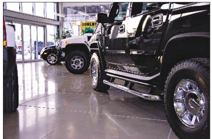
The floor of this car dealership is polished concrete with a natural appearance and decorative saw cuts.

While gray concrete is the norm, color can add significant dimension to a polished floor. With new installations, integral color can be added to the fresh concrete mix, or for a more intense effect, installed by the concrete contractor as a shake-on color hardener.