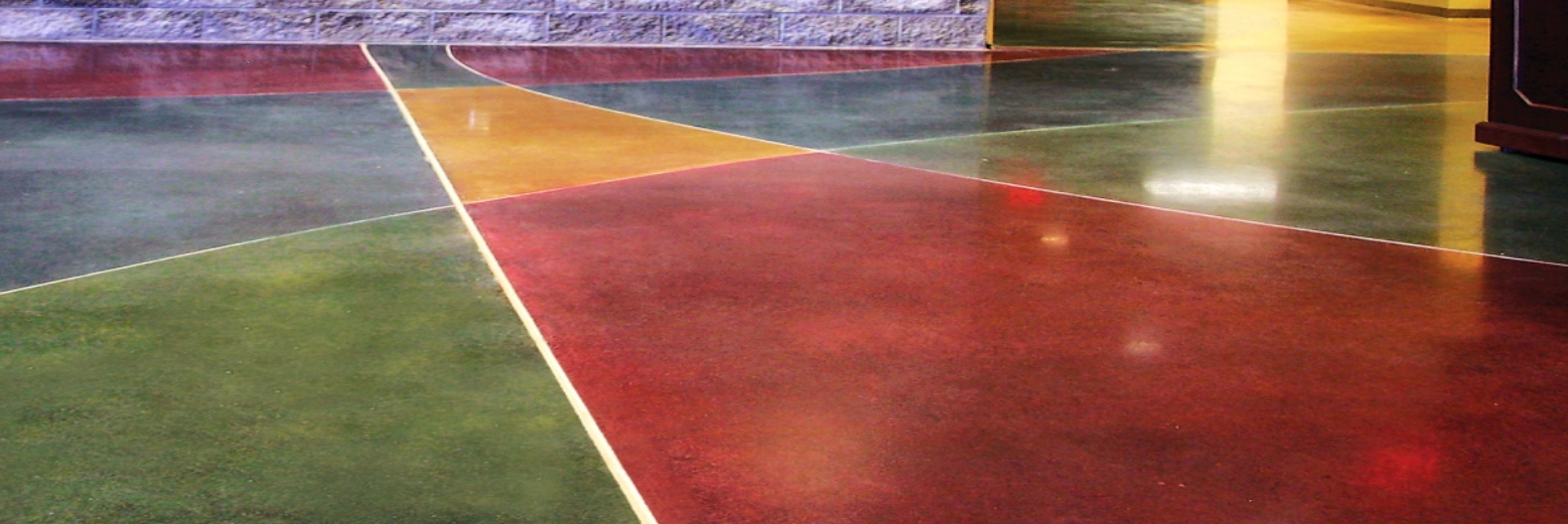
Colored admixtures, shake-on color hardeners, penetrating chemical stains and dyes add interest and beauty to polished concrete floors.

part of the concrete's hard-troweled surface is removed during the polishing steps. Microscopic inspection reveals an open-pore structure and cement matrix now more vulnerable to wear. Second, because such a high gloss can be obtained by polishing concrete, a common misconception is to believe the process has closed up the floor when the exact opposite has occurred.