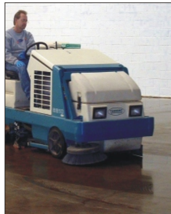
◀ Application of a penetrating densifier is necessary to provide long term, low cost protection of the polished floor.