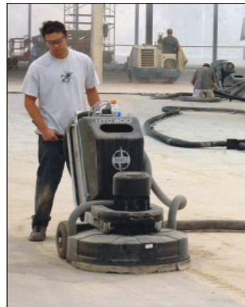
◀ A walk-behind, diamond-impregnated disc grinder is used when working on large floor areas. The surface condition dictates the coarseness of the grinding steps. The disc options range from coarse-to fine-grit.

Proper testing will indicate the static coefficient of friction (SCOF) under both wet and dry conditions. Testing indicates finer grit levels and higher gloss actually provide a very safe floor for foot traffic, with SCOF readings increasing ( i.e. becoming more slip-resistant) with higher gloss levels.